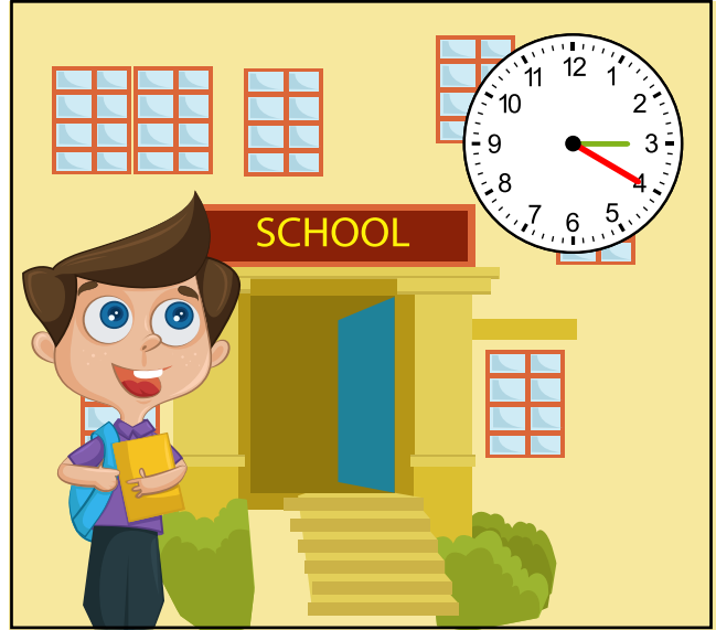
Returning from school.