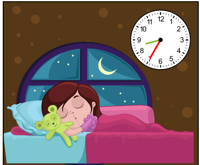
Go to bed at night.